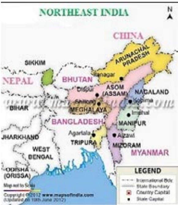
Figure 2. Map of Northeast India highlighting various states within the region