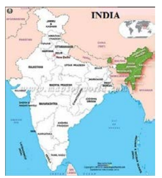
Figure 1. Map of India highlighting Northeast

42.34% in Meghalaya (table: 1). The region is also protected by the mighty Himalaya and about 70% of landmass of the region is either mountainous, hilly or plateau. The Himalaya Mountain not only protects the region from cold winter breeze blowing from the north, but also provides protection against invasion. The great Brahmaputra River flows from northeast corner to southwest corner, which is also a potential gateway of having international water transport network with Bangladesh and other countries. However, this very river is also considered to be facilitating illegal immigration to the region and other parts of the nation. Further, this river can be considered as the sorrow of Assam due to